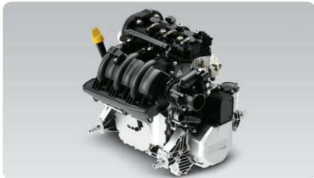
ROTAX® 900 ACE™ - 60 / 90 Two fuel-efficient, compact and lightweight Rotax engine options.