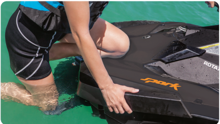
Boarding Step (Optional) Makes boarding from the water easier and quicker.