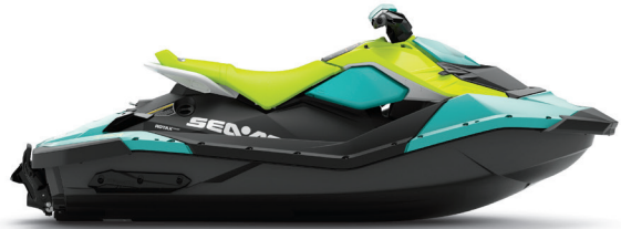
NEW Reef Blue & Manta Green

*May not be available at the time of purchase. Please check with your dealer. **Electronic brake, neutral and reverse. ***iBR® and Convenience Package Plus adds 21 lb (9 kg).