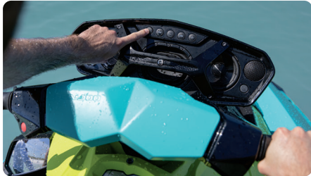
BRP Audio - Portable System (Optional) High-quality waterproof 50-watt Bluetooth† portable sound system.