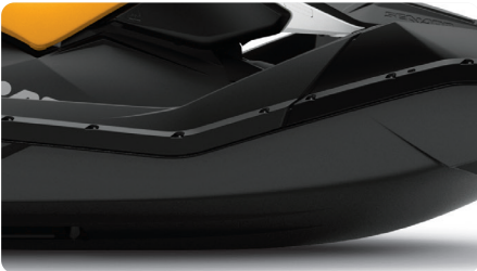
Polytec™ Innovative material that reduces weight while optimizing performance and efficiency. The color-in molding is more scratch-resistant than fiberglass.