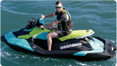
Slim Seat Designed to improve freedom of movement while riding.