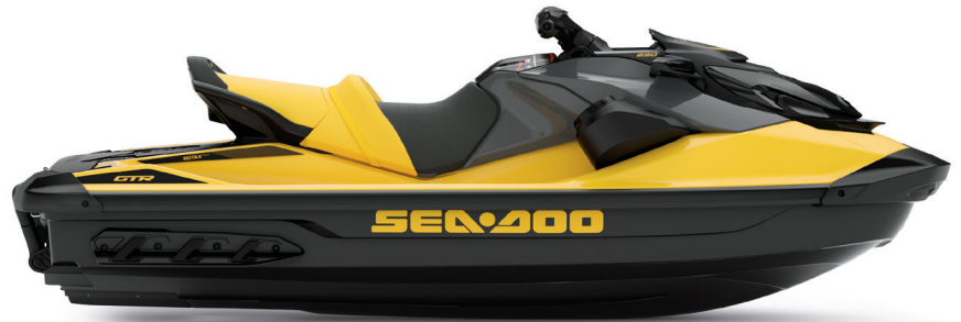
● NEW Millennium Yellow